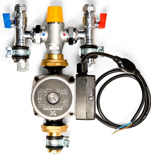
product shown SL11PMA

Inta's small area underfloor pump mixer kits are specifically designed for instances where an underfloor loop is an addition to an existing conventional system. Our pump mixer kits are suitable for floor areas up to 30m 2 and have an adjustable temperature range of 30 -60°C making them suitable for a variety of floor coverings.